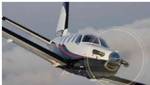
DAHER-SOCATA TBM 850

In 1990, DAHER-SOCATA certified with the FAA and French DGAC (now EASA) the first, fully-pressurized, single-engine, turboprop